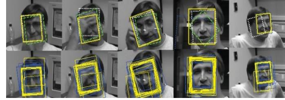
Fig.2 Part based pose oriented frames

Analysis of Variance (ANOVA) is a hypothesis-testing technique used to test the equality of two or more population means by examining the variances of samples that are taken. ANOVA allows one to determine whether the differences between the samples are simply due to random error (sampling errors) or whether there are systematic treatment effects that cause the mean in one group to differ from the mean in another. The test images are shown in Figure 2 and Figure 3 respectively.